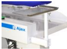
Option Iron Table

ADP-610 Central Vacuum Type ADP-610T Self-contained Vacuum Pants Press