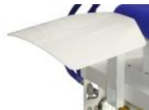
Option Topper Table (ADP-610/610T come with this)